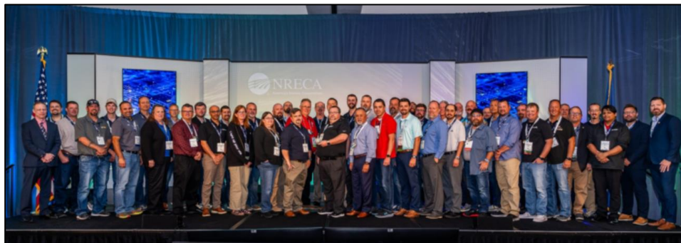
Cyber Tech Conference, June 2024