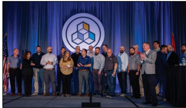
Cyber Tech Conference, May 2023

NRECA continues to recognize co-ops who completed a Level of the goals in time for our annual Co-op Cyber Tech conference. As shown in the following photos, the number of attending co-ops has increased significantly each year, showing program momentum and popularity with our members.