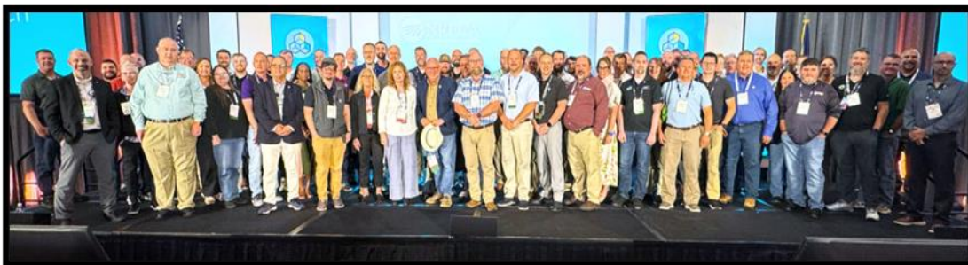
Cyber Tech Conference, June 2025